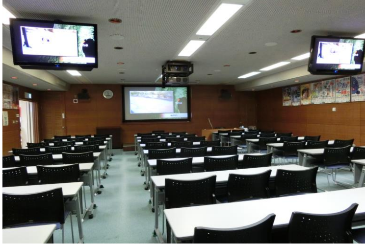
A short movie about the past of Japan earthquake