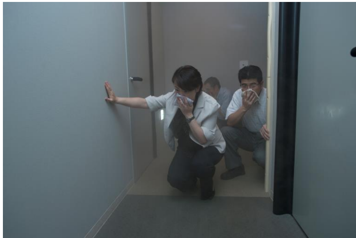
Escaping from smoke