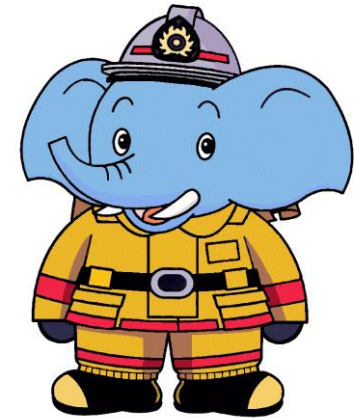
Mascot character of Ikebukuro Life Safety Learning Center "IKEZO-KUN".

short movie about the past of Japan earthquake, using fire extinguisher, escaping from smoke and an earthquake simulation.