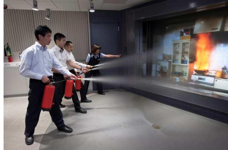
Using the fire extinguisher ( over 10 years old )