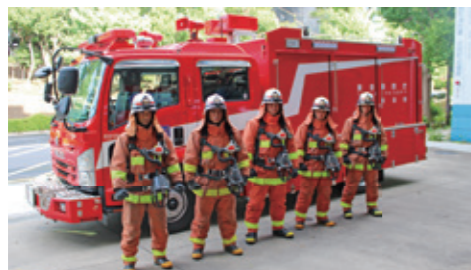
▲Nagatacho Unit (Present)

【Deployment】 Kojimachi FS, Shiba FS, Kamata FS, Meguro FS, Setagaya FS, Shinjuku FS, Suginami FS, Toshima FS, Itabashi FS, Nerima FS, Shakujii FS, Ueno FS, Adachi FS, Fukagawa FS, Joto FS, Edogawa FS, Musashino FS, Fuchu FS, Higashikurume FS, Hachioji FS, Ome FS, Machida FS and Tama FS