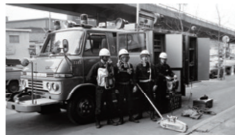
▲Nagatacho Unit (in 1971)