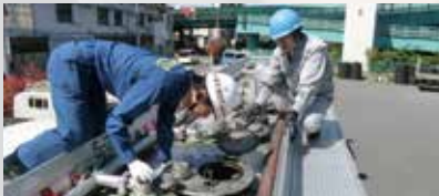
Tank truck checking

A restaurant fire developed into a catastrophe in Itoigawa City. This incident led to the amendment of the Fire Service Law, and the placement of fire extinguishers was made mandatory for every restaurant. The TFD urges restaurants to have extinguishers, and gives kitchen fire prevention advice.