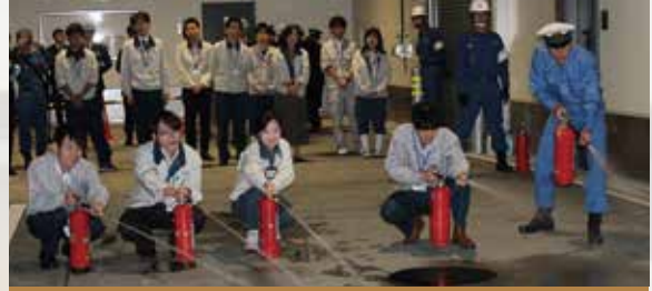
Fire drill at the Toyosu Market

For Market visitors' safety, the TFD calls for the appointment of fire protection managers and others, the preparation of fire protection plans, and fire/evacuation drill management skill development.