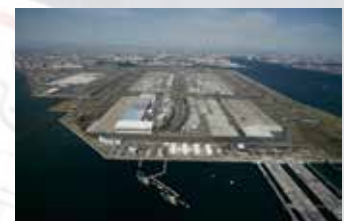
Tokyo International Airport Area

With this designation, the TFD has been reinforcing its forces with additional fire apparatus and equipment, teaming up with the private sector, and promoting hands-on fire drills.