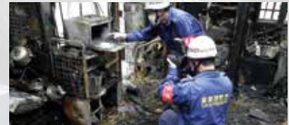
Fire cause investigation