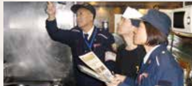
Restaurant kitchen inspection