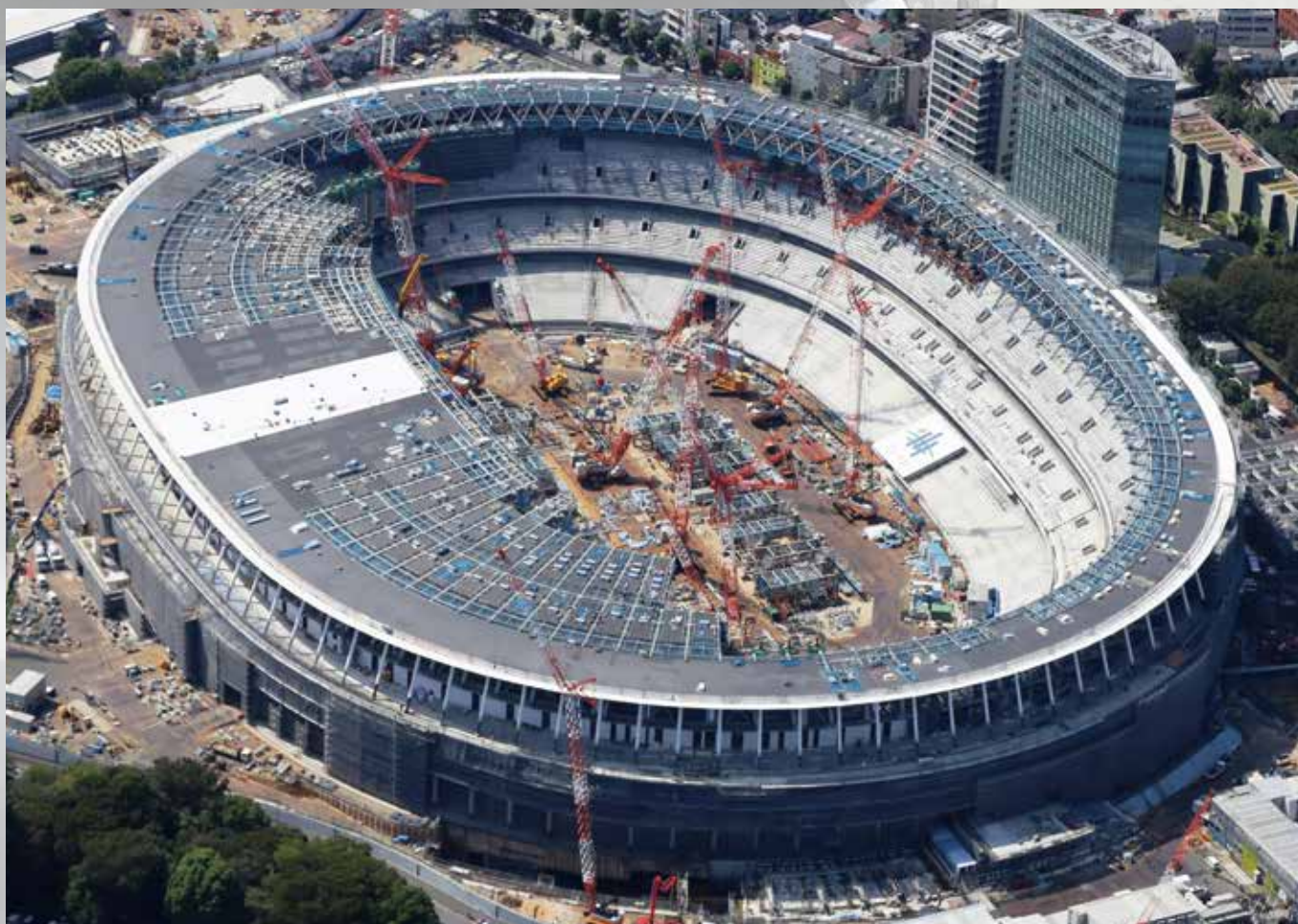
New National Athletic Stadium (under construction)

The TFD checks commercial buildings and hazmat facilities for fire hazards, gives fire protection management advice, conducts fire cause investigations/analyses, and others for greater safety.