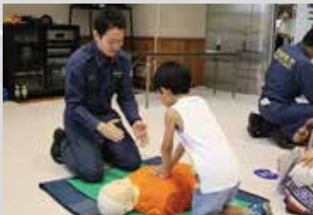
First aid training