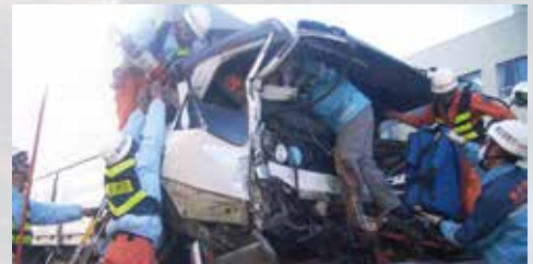
On-site rescue and first aid